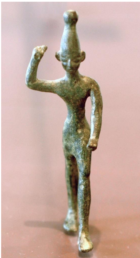
2. Baal with right hand raised (Jastrow 2006b)

closely associated with Baal that she may at times have been considered his consort.