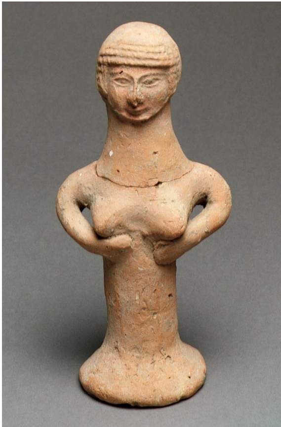
3. Pillar-based nude female figure; Lachish, ca. 8 th -7 th century BC (Anon. 2017)