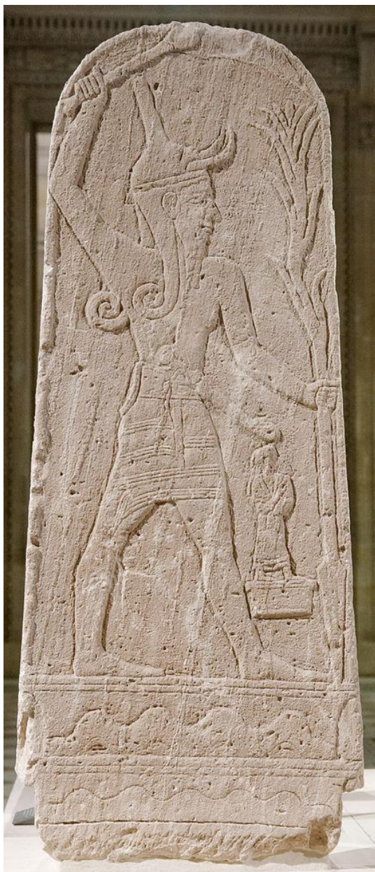
1. Baal with thunderbolt (Jastrow 2006a)

When it comes to the gods and goddesses of Canaan, we would not have much to go by if it were not for the fortunate discovery of a significant library of clay tablets at Ugarit. Ugarit is located to the north of Lebanon in today’s Syria. Strictly speaking, it is therefore not part of Canaan proper. Nevertheless, the language, Ugaritic, is closely related to various Canaanite dialects, and the culture appears to have been similar as well. It is assumed that the mythology reflected in the Ugaritic texts that have been excavated closely resembles that of Canaan. Much is still unclear, and new discoveries or insights may make corrections of the reconstruction below necessary.