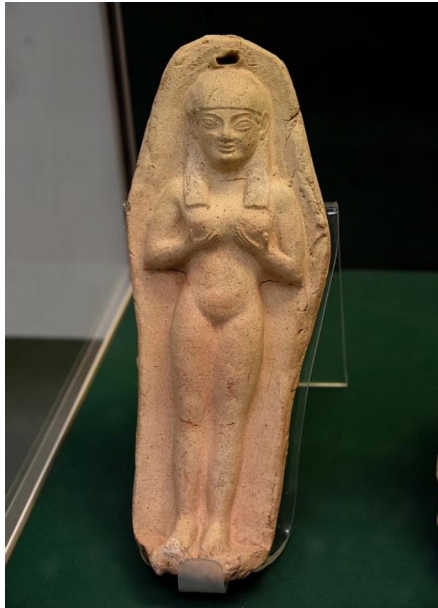
4. Nude woman, probably the goddess Astarte; Sardinia (Phoenician), 6 th century BC (Amin 2017)

both El and Baal. This could lead to associating Yahweh with Asherah as his wife – and representing him using the form of a bull or calf (see Fig. 6).